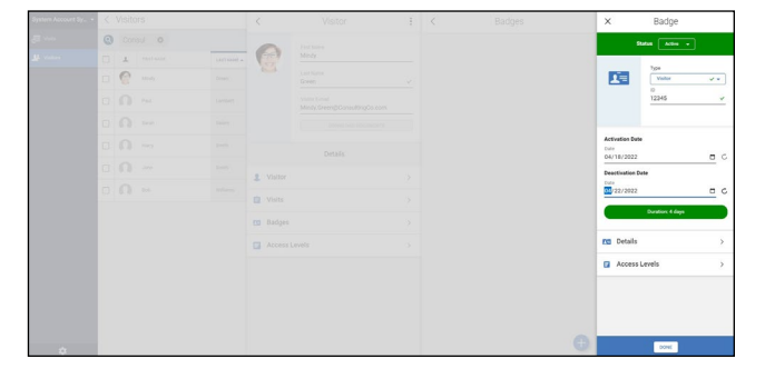
OnGuard Access manager allows access level management on active and inactive badges

For more information and links to technical documents, visit the LenelS2 Partner Center. \label{eq:control}