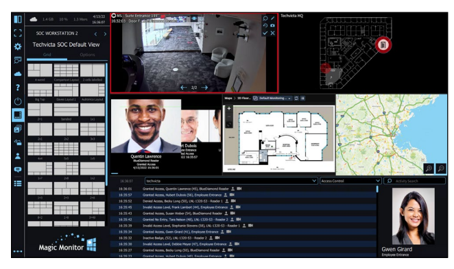
OnGuard system alarms, cardholders, video and system data, as viewed in unified Magic Monitor client