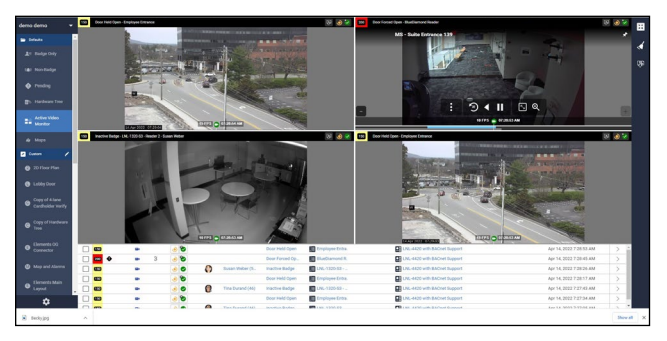
OnGuard Monitor client and the new Active Monitor display