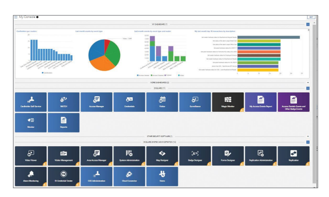
LenelS2 Console launchpad showing custom dashboards