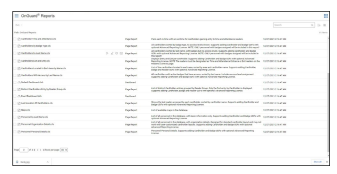
Reports & Dashboards client reports list and descriptions