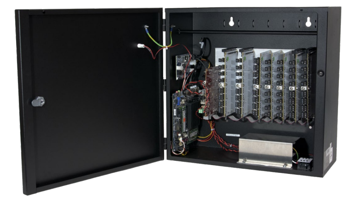
Up to seven LenelS2 Application Blades in any combination can be supported by a Network Node.

Up to seven LenelS2 Application Blades in any combination can be supported by a Network Node. LenelS2 Application Blades are easy to install – Network Nodes automatically recognize and address them without jumpers or switches. Power and communications are delivered to every LenelS2 Application Blade via a ribbon cable bus, and the blade supplies 12VDC, up to 250mA, per card reader.