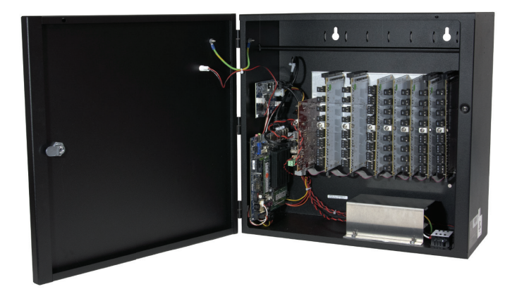
Up to seven LenelS2 Application Blades in any combination can be supported by a Network Node.

Up to seven LenelS2 Application Blades in any combination can be supported by a Network Node. LenelS2 Application Blades are easy to install – Network Nodes automatically recognize and address them without jumpers or switches. Power and communications are delivered to every LenelS2 Application Blade via a ribbon cable bus, and the blade supplies 12VDC, up to 250mA, per card reader.