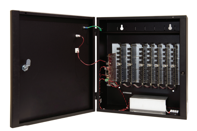
Up to seven LenelS2 Application Blades in any combination can be supported by a Network Node.

Up to seven LenelS2 Application Blades in any combination can be supported by an Network Node. LenelS2 Application Blades are easy to install – Nodes automatically recognize and address them without jumpers or switches. Power and communications are delivered to every LenelS2 Application Blade via a ribbon cable bus.