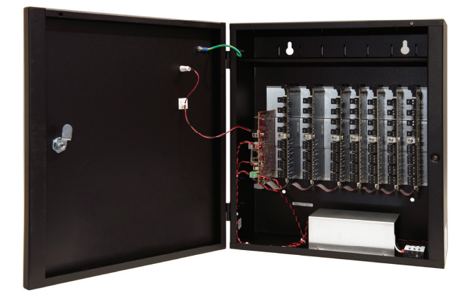
Up to seven LenelS2 Application Blades in any combination can be supported by a Network Node.