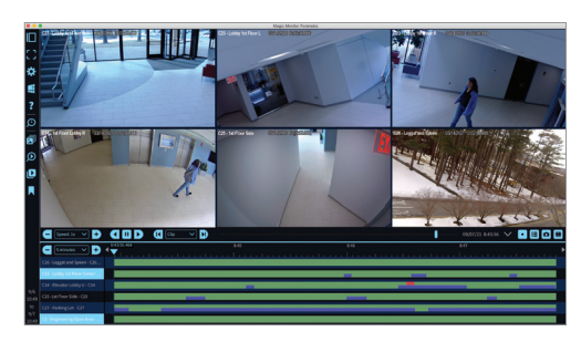
Easily search, review and catalog video with Magic Monitor Forensics.

The NetBox VRx Quatro system is ideal for stand-alone installations or as a member of a NetBox Global distributed network where it can be locally or remotely managed.