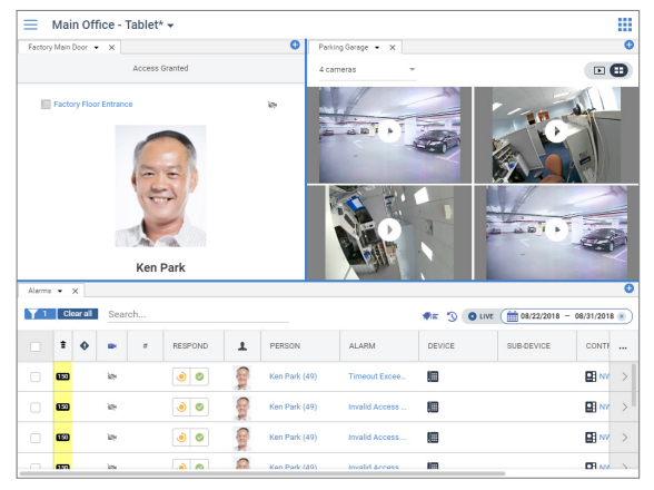
OnGuard Monitor client with video