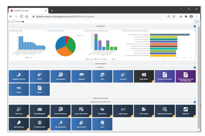
LenelS2 Console launchpad showing custom dashboards