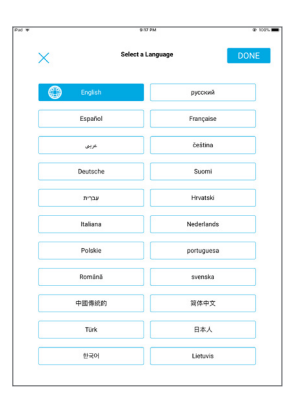
OnGuard Visitor Self Service app language selection interface