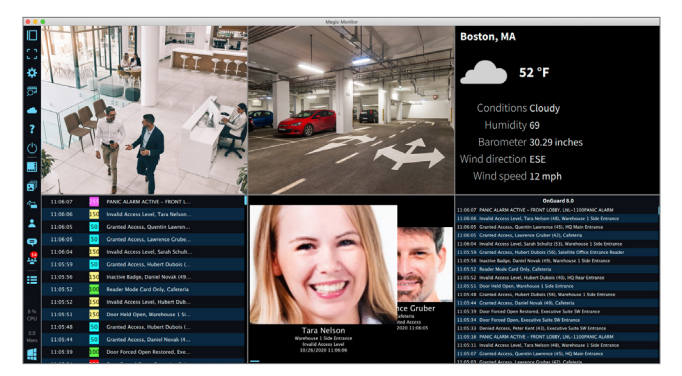
OnGuard system alarms, cardholders, video and system data, as viewed in unified Magic Monitor client