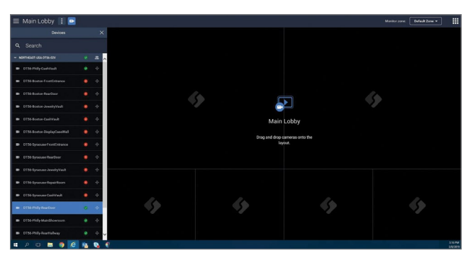
Drag and drop cameras to layout