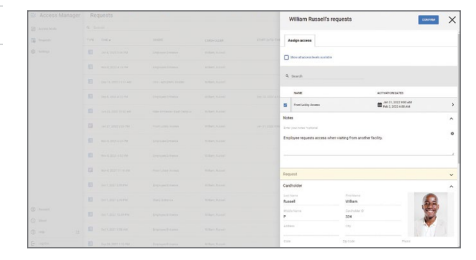
See Details of Requests from OnGuard CSS