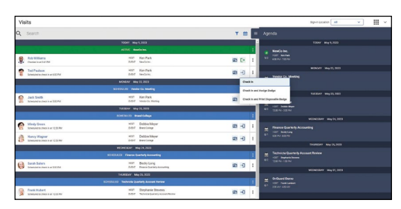
Visits List - Agenda View