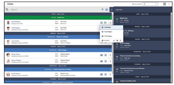
Check-in Visitor and Print Disposable Badge