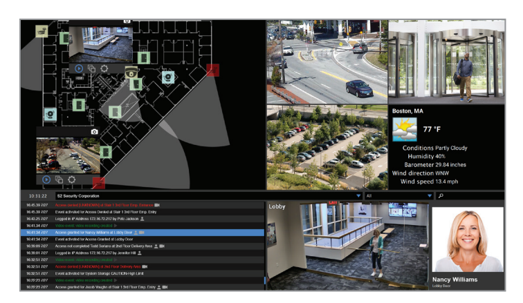
Access control and event monitoring for connected devices are aggregated to the LenelS2 Magic Monitor® unified client.

Designed for localized access control and event monitoring, the MicroNode Plus panel is also an ideal retrofit solution. The seamless upgrade from legacy two-reader panels to the MicroNode Plus panel can be made without replacing readers, inputs or lock outputs.