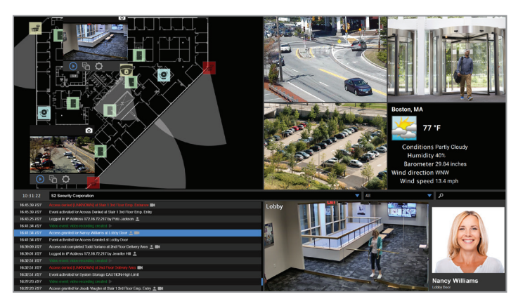
Access control and event monitoring for connected devices are aggregated to the LenelS2 Magic Monitor® unified client.

A highly flexible component of any NetBox system, the Network Node panel enables customization and expansion of the system's capabilities.