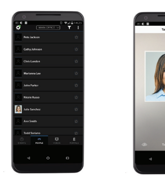
Photo ID Capture: Allows users to take photos and add them to person records using a camera on an iOS or Android device.

Event Monitoring: Mobile Security Professional displays all event activity and allows users to view video of interest with one touch.