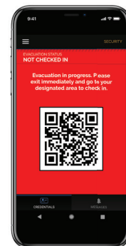
Mustering: Mobile Security User virtual photo IDs include a linked QR code for mustering during evacuations.