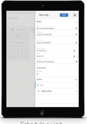
Schedule a visit